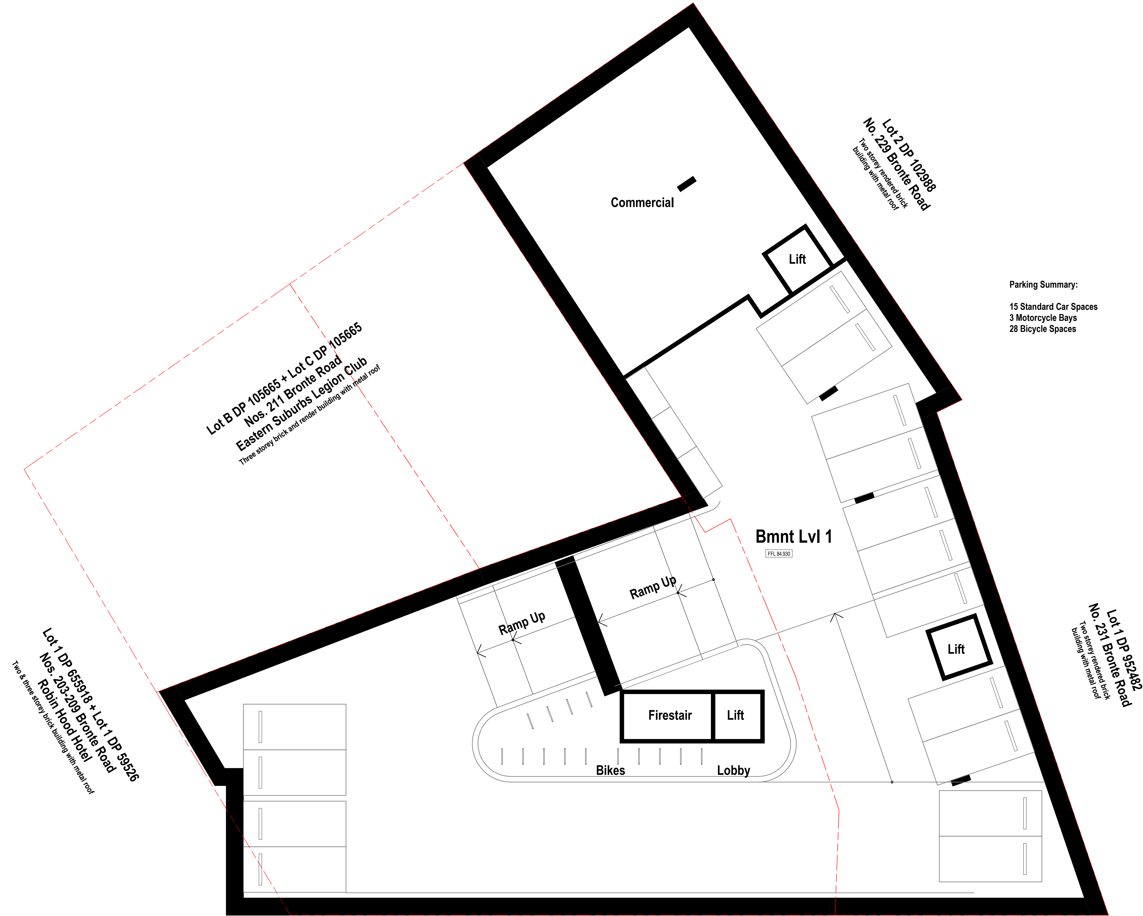
1 GA Plan - Basement Level 01 - Proposed